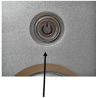
This is a typical PC on button, on the front, in the middle of the tower