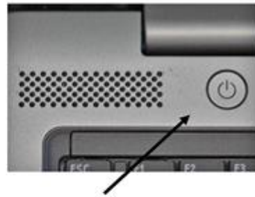
This is a typical laptop on button. Most laptops have the on button just above the keyboard but below the screen